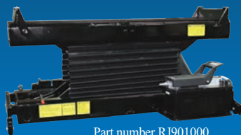
Part number RJ901000

Longer slip plate designed to accommodate a greater wheelbase range for two and four wheel alignments