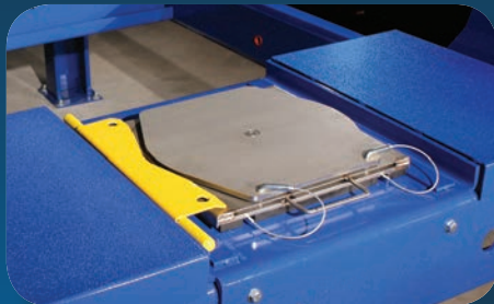
Photo shows optional stainless steel turning radius gauges

Alignment lifts come standard with two carbon steel turning radius gauges - roll back bar allows the gauges to be placed in the front or back of the slot while keeping a flat runway surface.